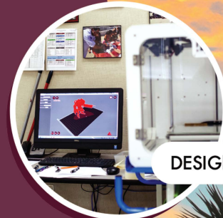
DESIGN & MODELING